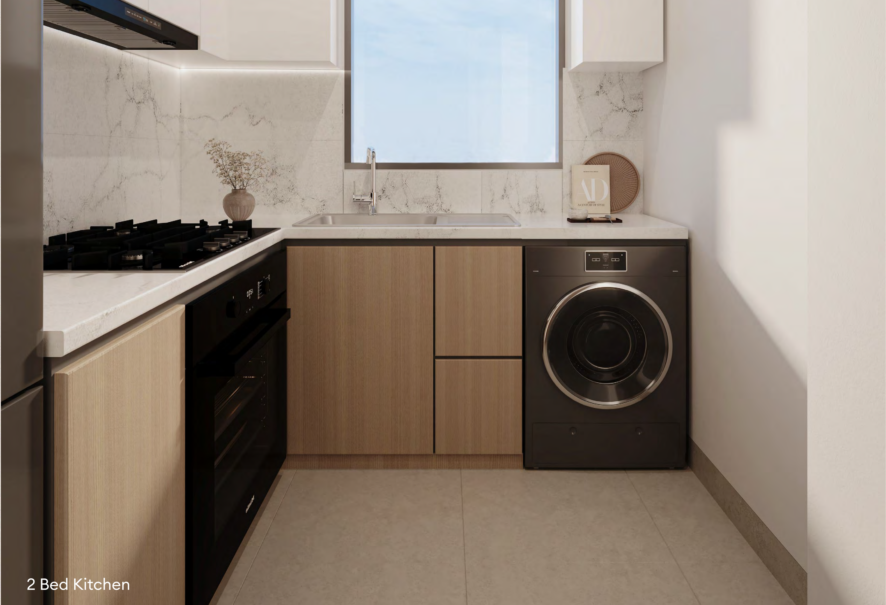
2 Bed Kitchen