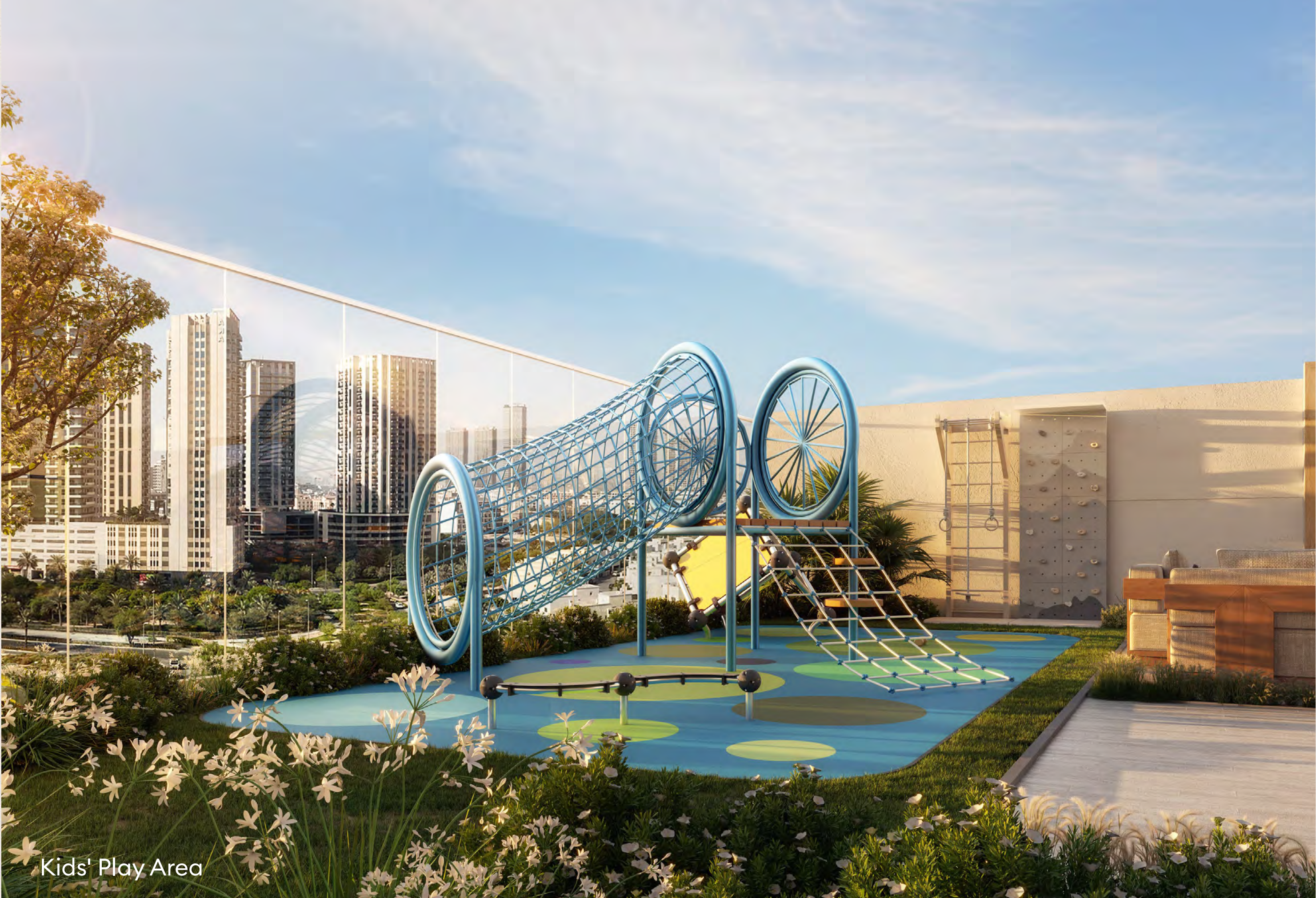
Kids' Play Area