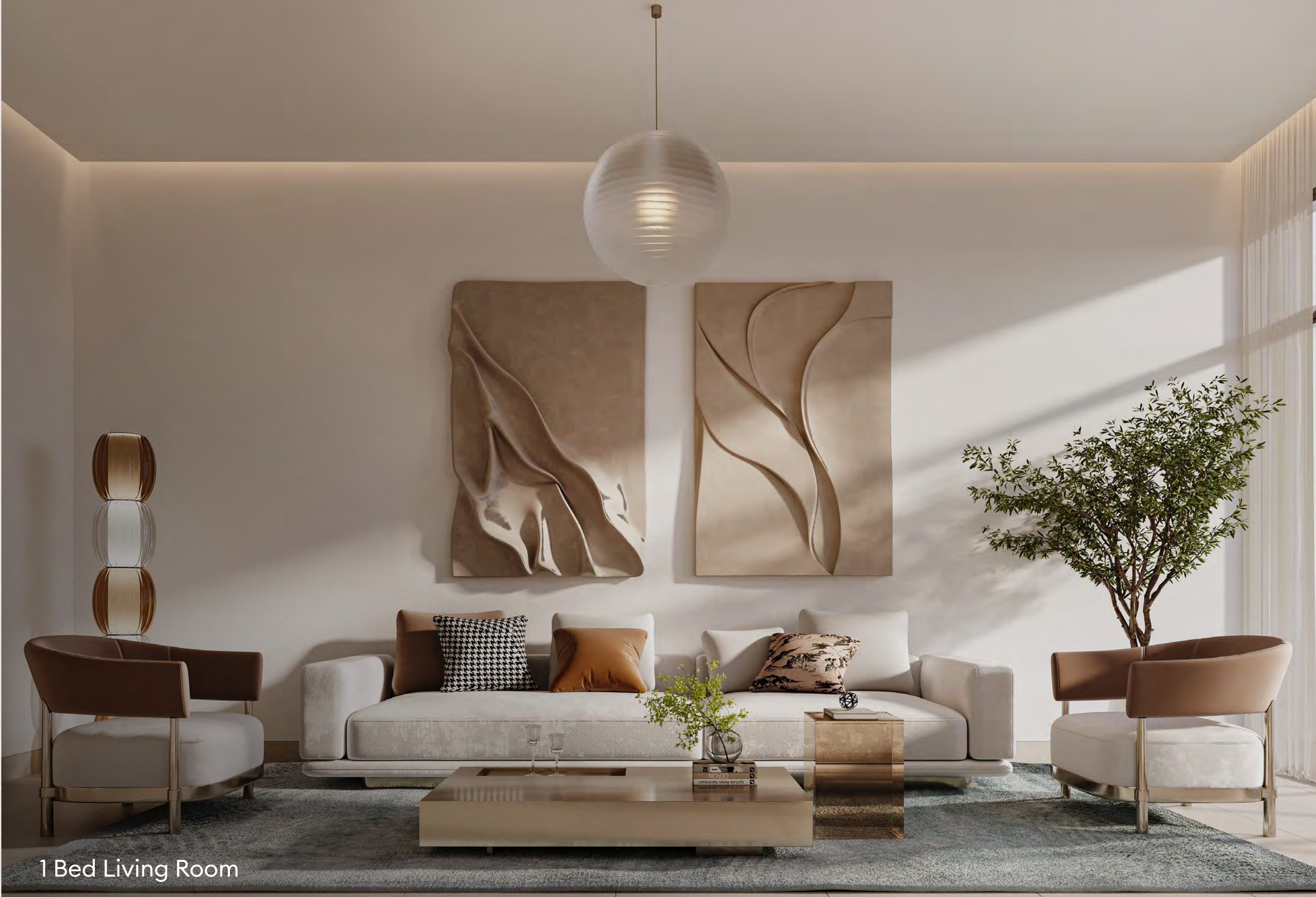
1 Bed Living Room