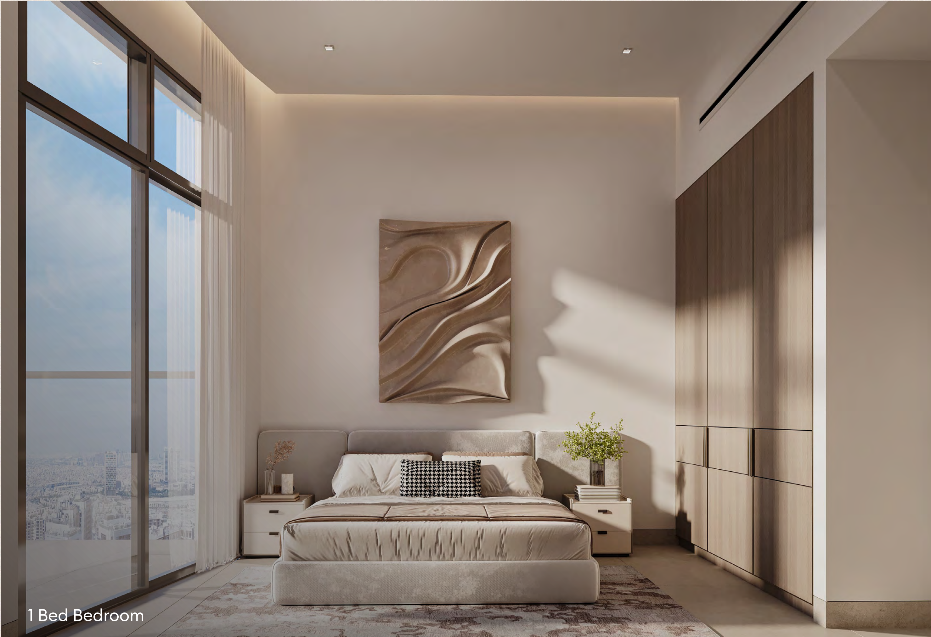
1 Bed Bedroom