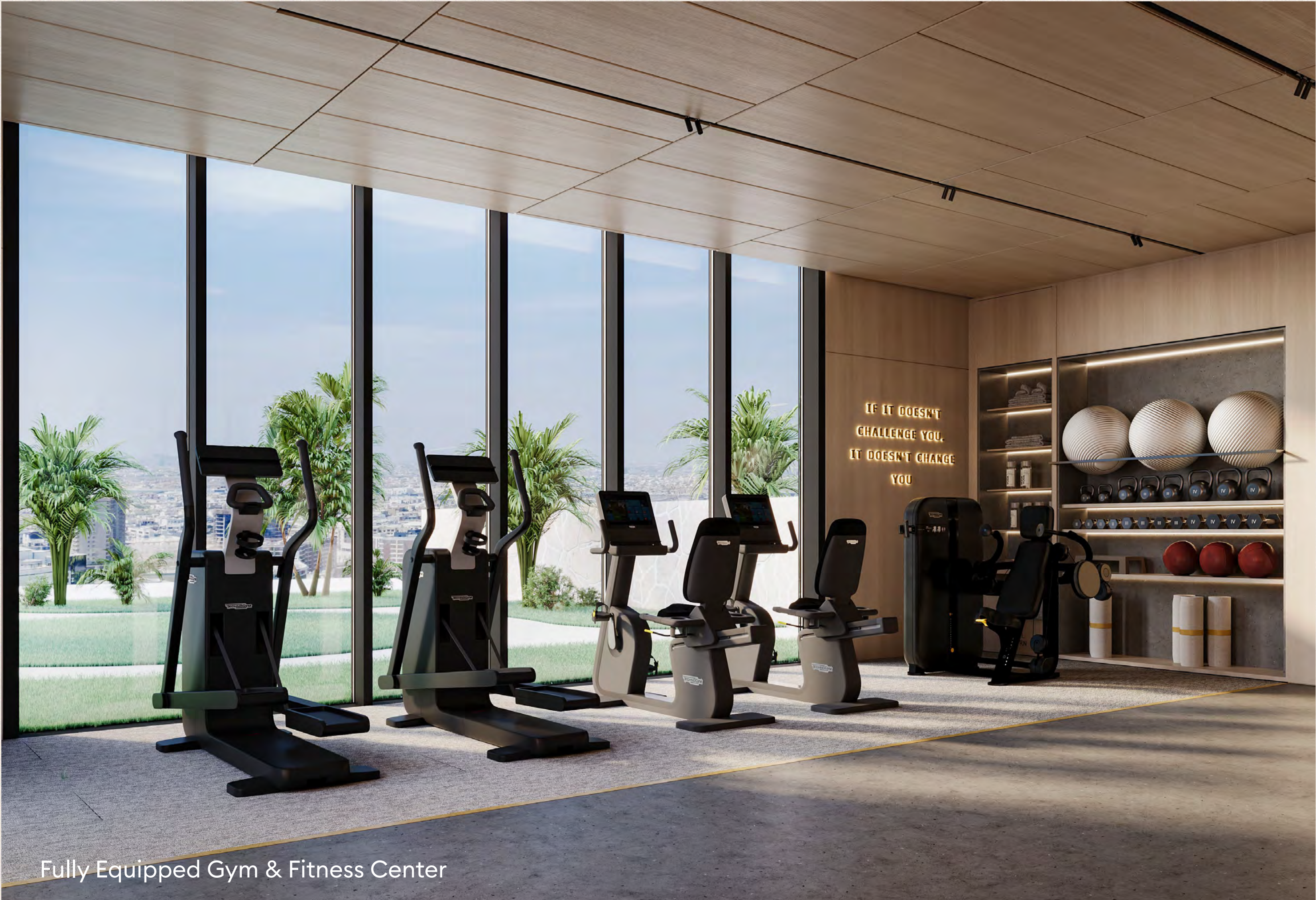
Fully Equipped Gym & Fitness Center