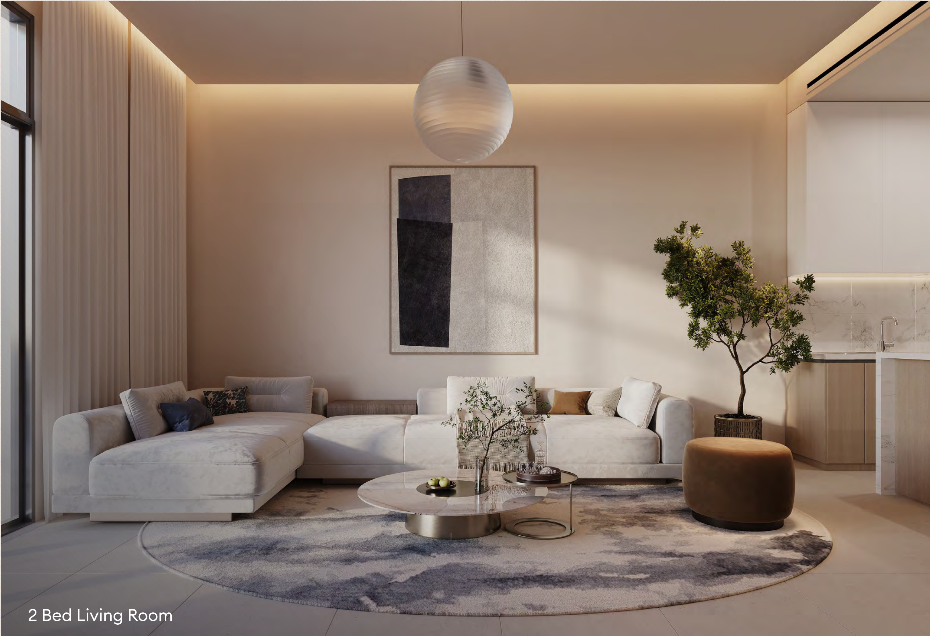
2 Bed Living Room