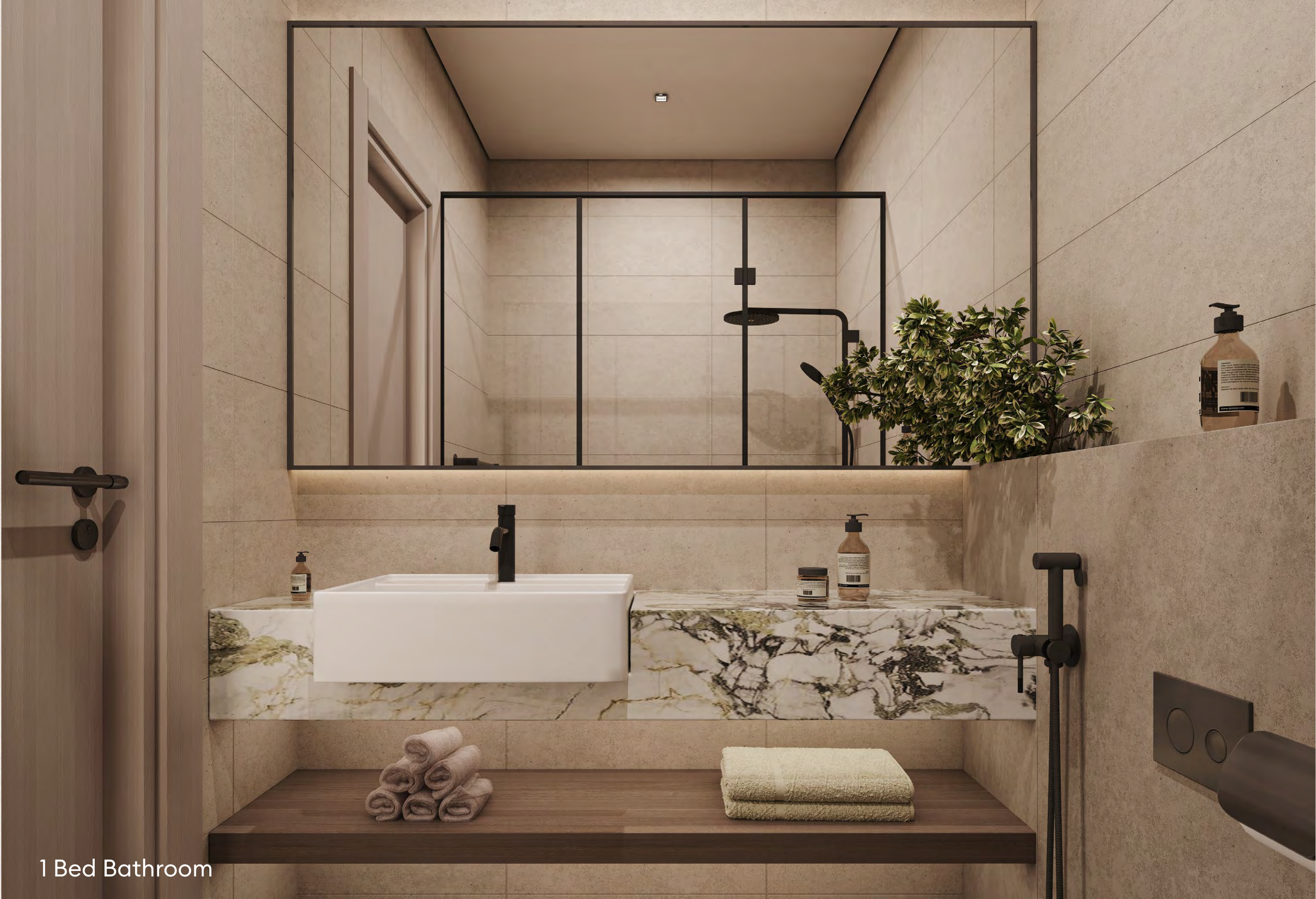
1 Bed Bathroom