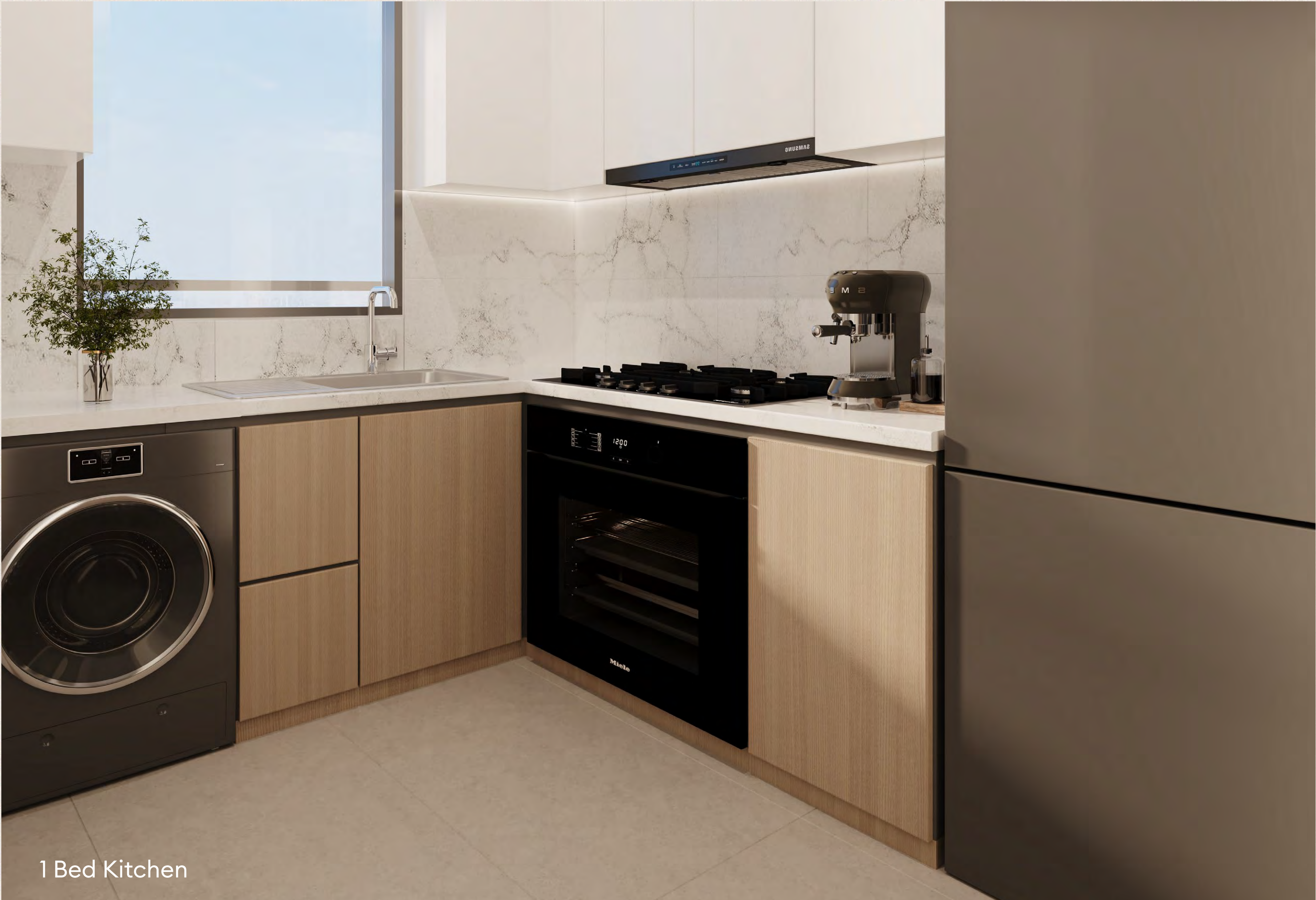
1 Bed Kitchen