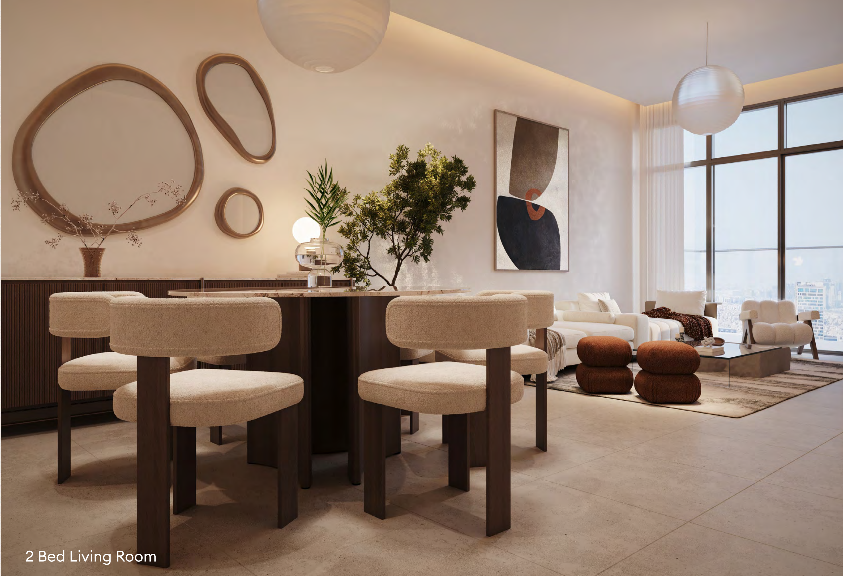
2 Bed Living Room