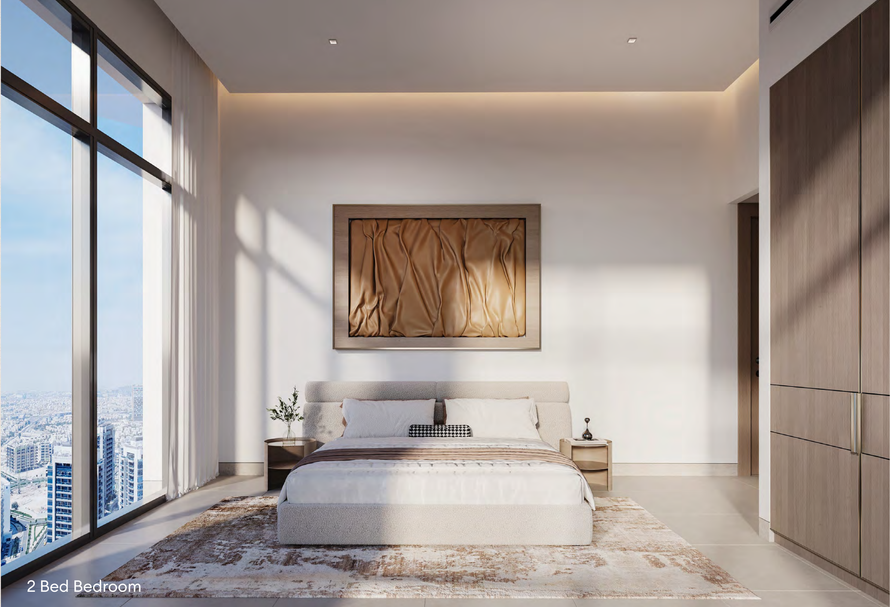
2 Bed Bedroom